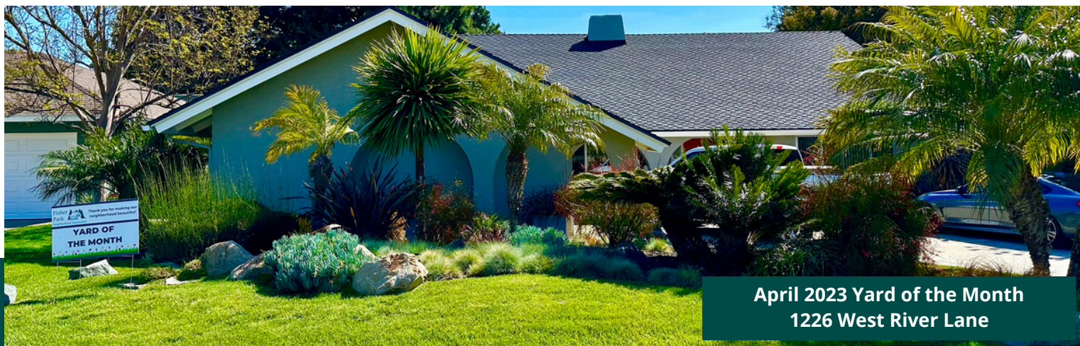
April 2023 Yard of the Month 1226 West River Lane