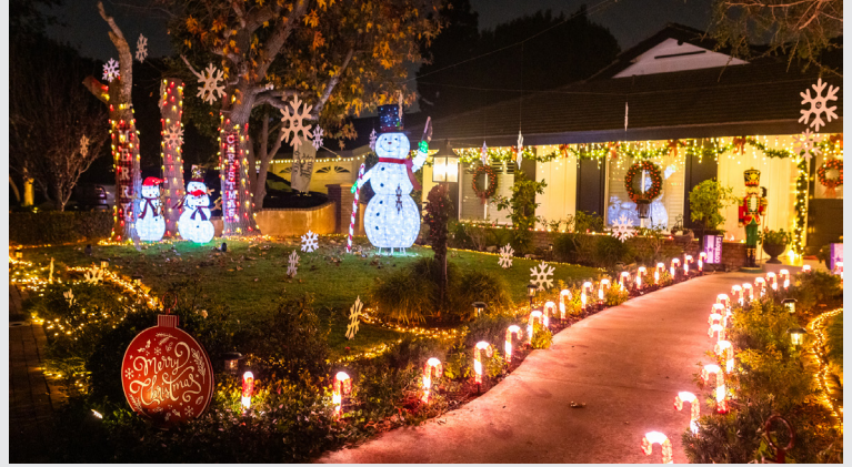
2024's Grand Champion winner, 1234 Sharon Rd.

Our annual Holiday Decorating Contest is back, so trim the trees and light the lights! Three winners will be selected: one from Fisher Park west of Flower St, one from Fisher Park east of Flower St, and a grand champion overall winner. Winners will receive gift cards and are not eligible to win two years in a row, but will be admired nonetheless!