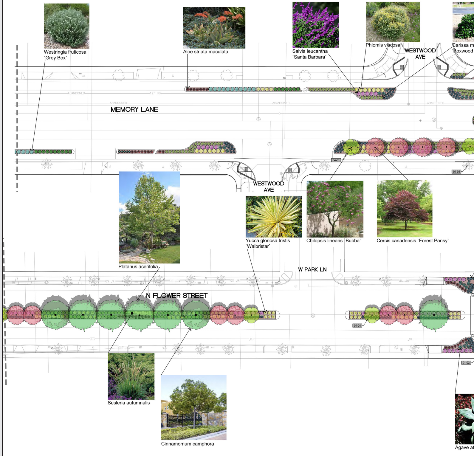
Landscaping plans for Memory Ln and Flower St.