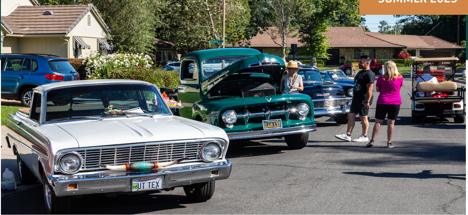
Browsing the classic cars along the Promenade during West Floral Park and Fisher Park's 2025 Open Garden Day.